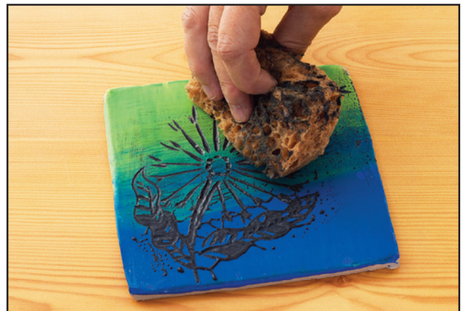
Step 4: Brush underglaze over carved lines. Sponge underglaze off waxed areas. Dry and fire.