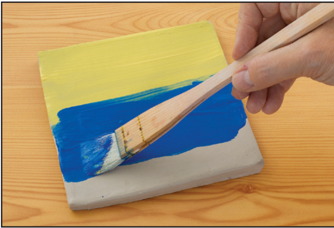
Step 1: Brush underglazes onto leather-hard clay. Allow to dry until dry to the touch.