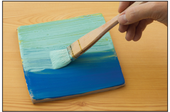
Step 2: Apply a layer of wax resist over colored areas. Allow to dry for one hour or overnight.