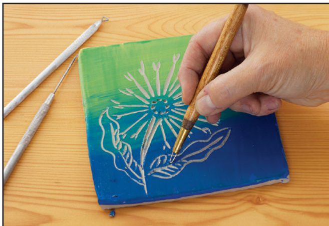
Step 3: Carve through the wax down to the clay beneath.